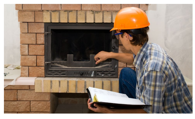
Register: To register your clean-burning device, visit <u>valleyair.org/deviceregistration</u>.

Regular servicing of your wood-burning device will keep it burning cleanly and efficiently, and produce the fewest emissions possible. You can contact an authorized Change-Out retailer or a reputable chimney sweep to have your device serviced annually.