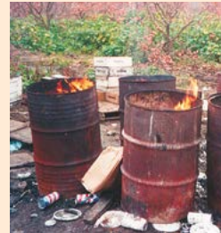
Burning anything in a burn barrel is illegal!