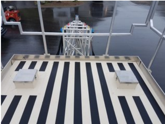
OSHA railing with Toe Board