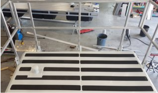
Roof with Railings and Anti-Slip