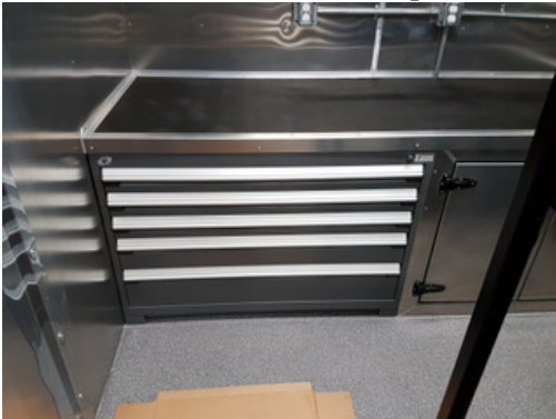
Example Counter tops and Toolboxes

Ancillary equipment (wheel chocks, fire extinguishers) will be provided as required. Counter tops will be constructed of aluminum framing with \frac{3}{4} " plywood underneath. Suggested surface is \frac{1}{8} " rubber material for electrical isolation and no slip work surface. Under counter tool boxes will be Rousseau type 4 drawer cabinets located as required. Wall cabinets as specified will be of similar construction as the tool boxes and mounted as per specifications.