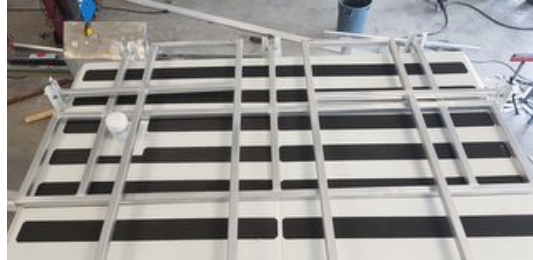
Folded Railing system for Transport