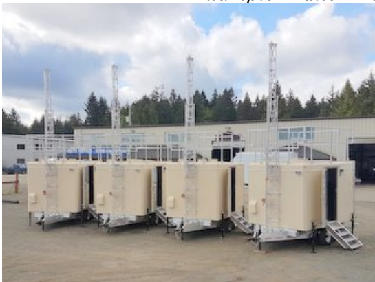
Example Trailer Mounted Nesting Towers