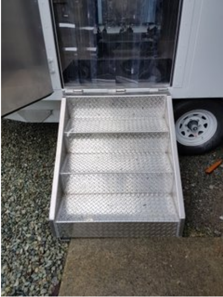
Example Doorway entrance stairway

Access stairways will be provided for the side entry of the enclosure. They will be of aluminum construction and hinge mechanisms will be integrated into the enclosure framing to allow for tilt up storage or removal.