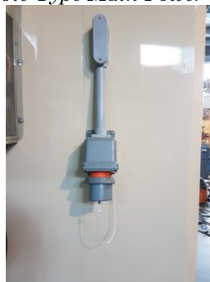
Trailer Box Entry